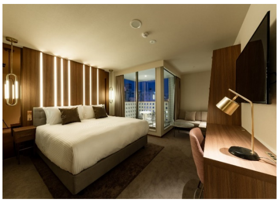
The OneFive Terrace Fukuoka