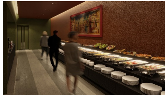
On the left: box seats along the wall. On the right: Aldo Rossi's sketches and a 11-meter buffet table.