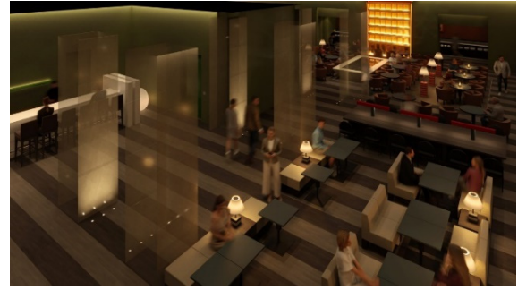
On the left: a bar counter designed with Shigeru Uchida's design perspective. On the right: a spacious lounge area. The lounge has newly designed tables and chairs with 130 seats.